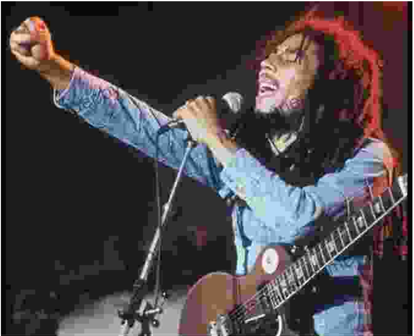
Bob Marley, the iconic reggae musician

lyrics. His impact on the music industry is immeasurable, earning him the title "King of Reggae."