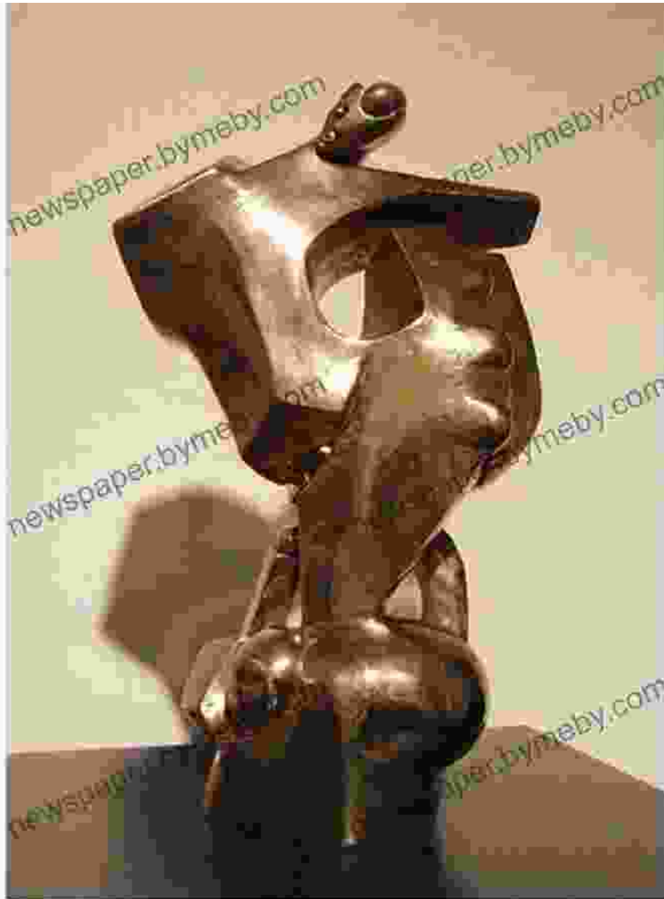
Endurance: A Testament to Resilience

Neizvestny's artistic journey began in the tumultuous post-war period. His early works, influenced by abstract expressionism, sparked controversy and drew the attention of the Soviet authorities. Undeterred, he continued to push the limits, experimenting with new materials and techniques, blurring the lines between painting, sculpture, and architecture.